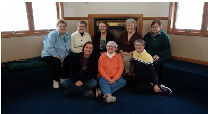
N/WLM Women of the ELCA Synodical Board

"I will be their God and they will be my people." Jeremiah 31:33b