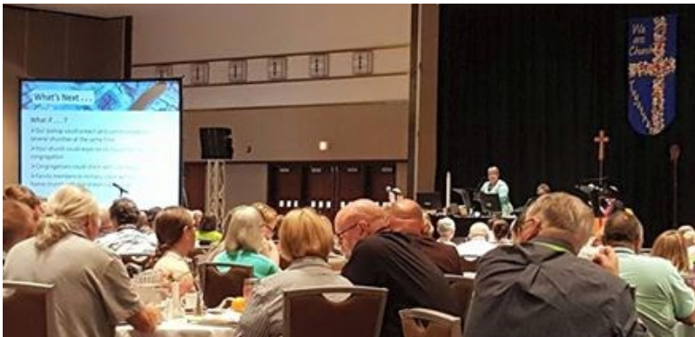
2015 Synod Assembly

In supporting congregations, the synod provides resources for candidates for rostered leadership, mission, outreach, renewal, youth, faith formation, outdoor ministry, social ministry, worship, public engagement, global mission, and much more.